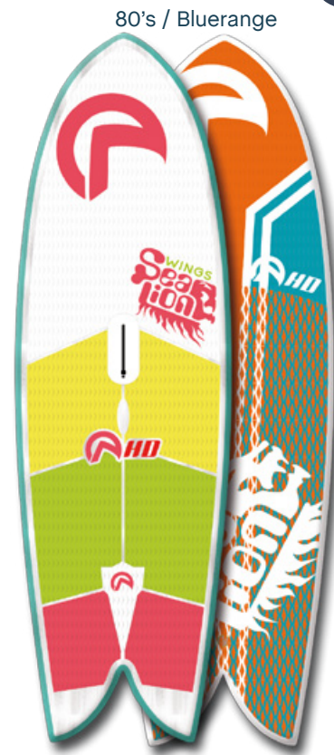
80's / Bluerange