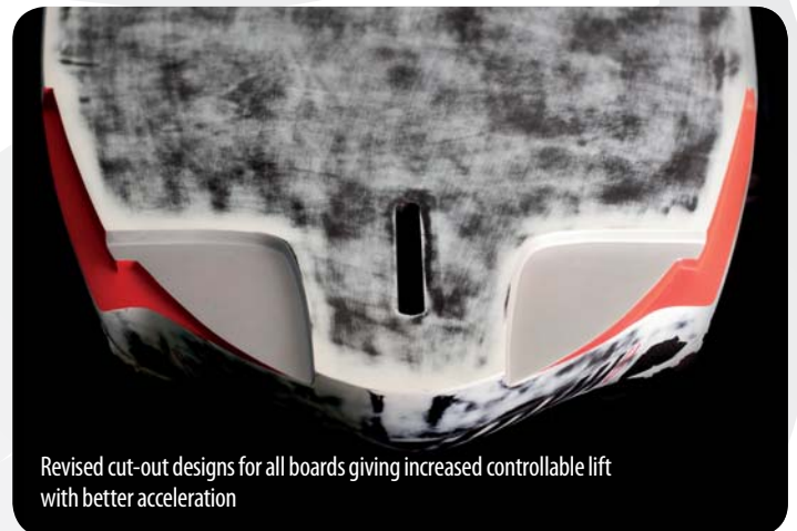
Revised cut-out designs for all boards giving increased controllable lift with better acceleration