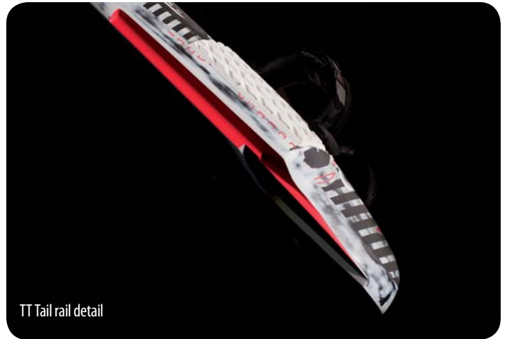
TT Tail rail detail