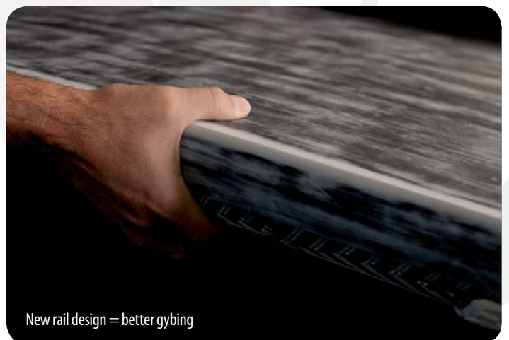
New rail design — better gybing