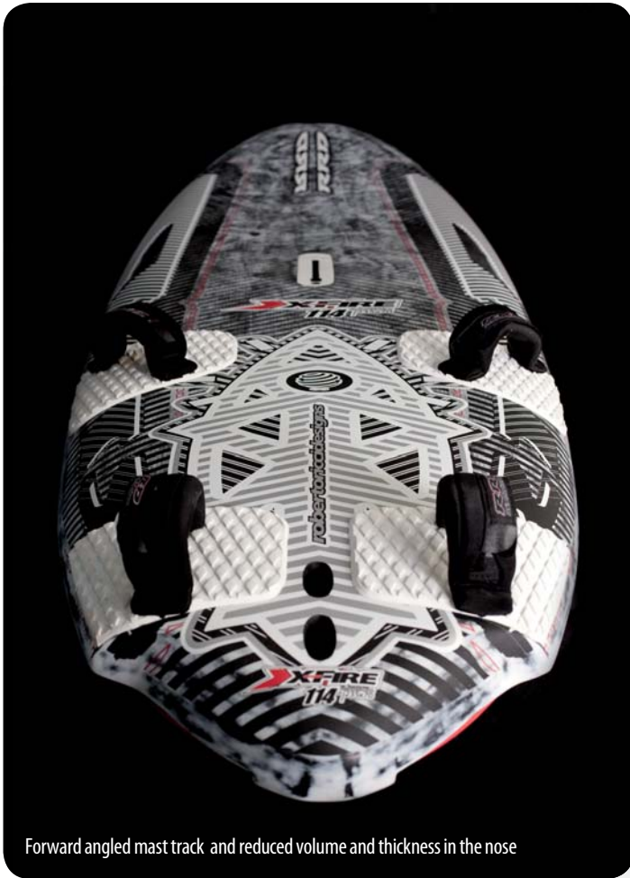
Forward angled mast track and reduced volume and thickness in the nose