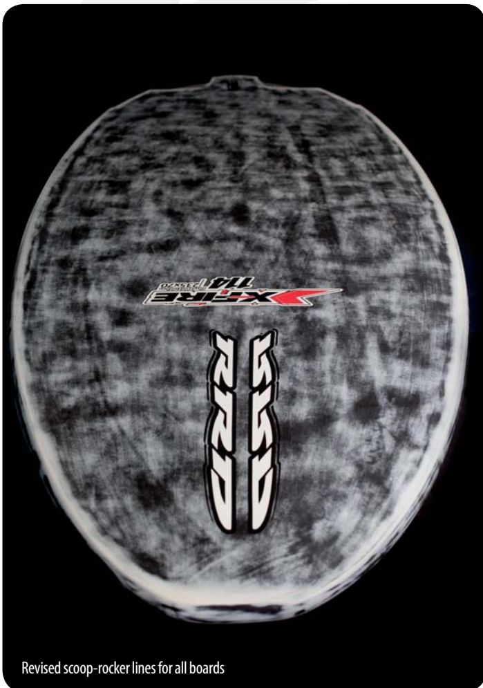
Revised scoop-rocker lines for all boards