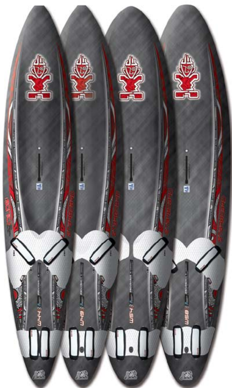
iSonic Speed Special W44